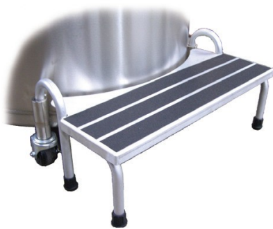
Optional Step (recommended for 818 and 819)